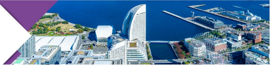
Exhibit Hall Schedule (subject to change)