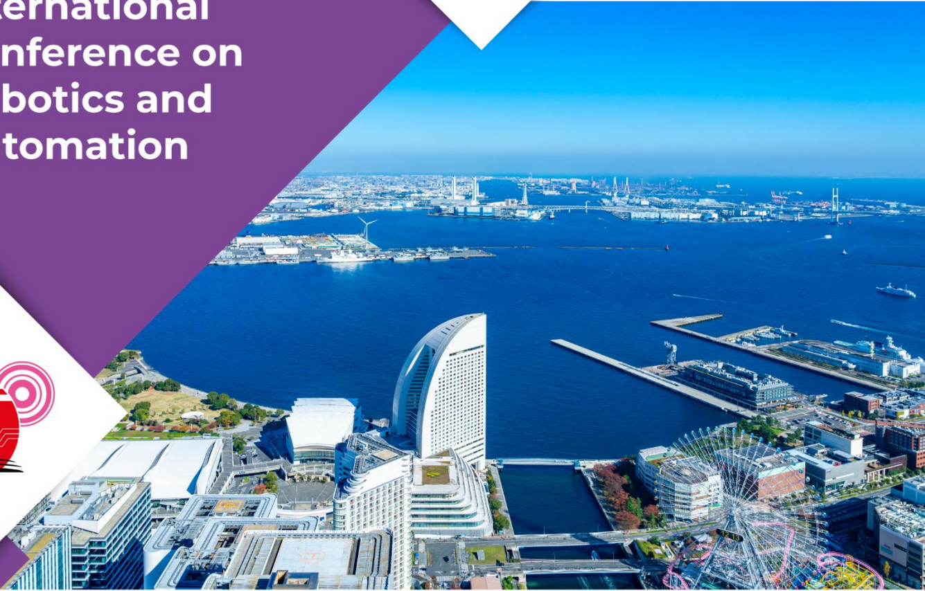
Exhibit & Partnership Prospectus

2024 IEEE International Conference on Robotics and Automation